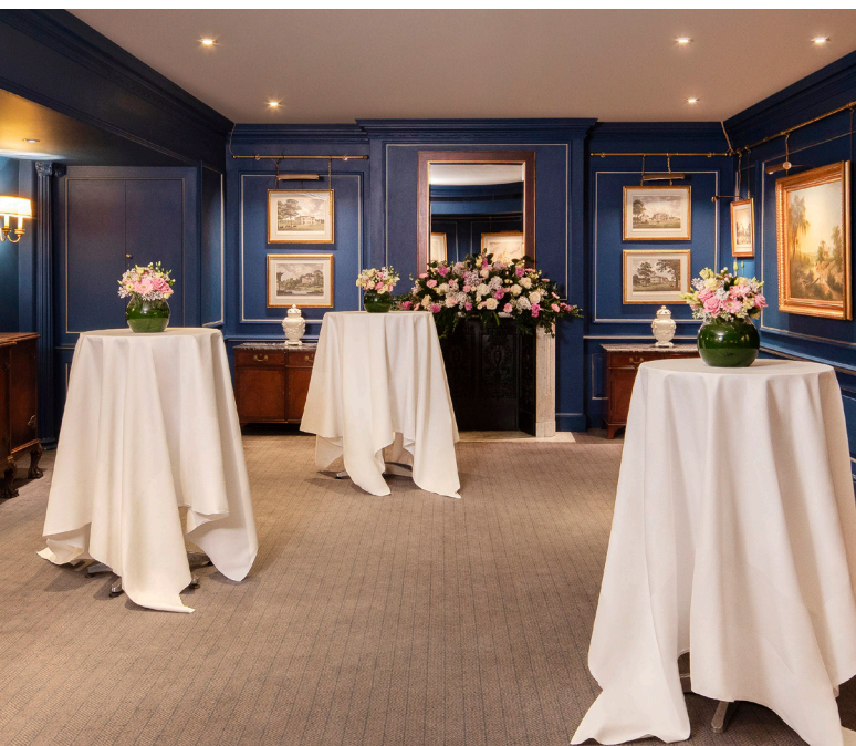
Reception - up to 60 guests with The Panel room