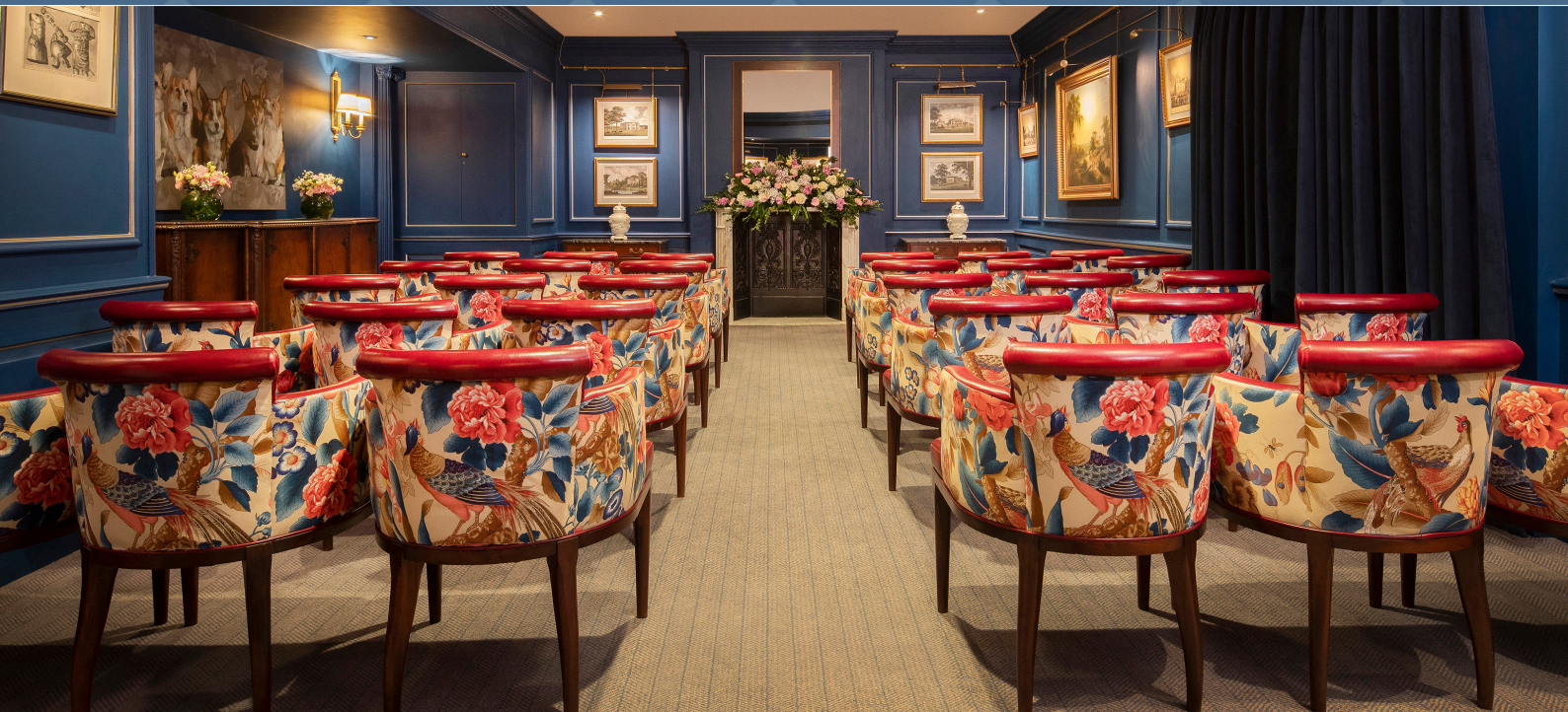
Theatre layout - up to 40 guests