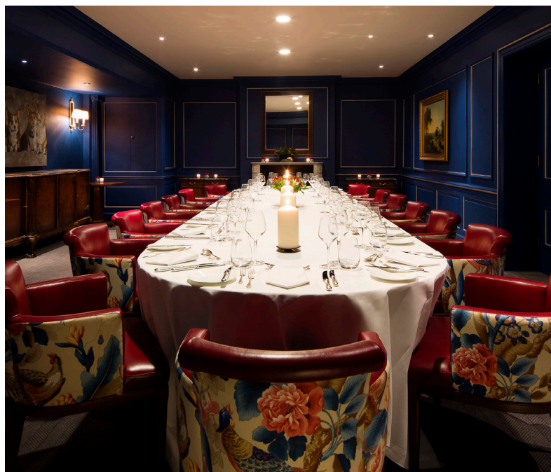
Oval layout - up to 26 guests or 24 guests with plasma screen